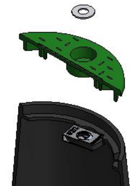
Bolt Down Detail